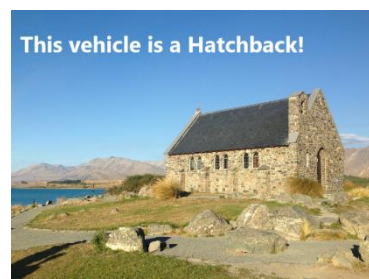
Corresponding Image Poster for Hatchback vehicle

To insert a placeholder double-click it from the list of available items. The placeholder will be inserted between parentheses.