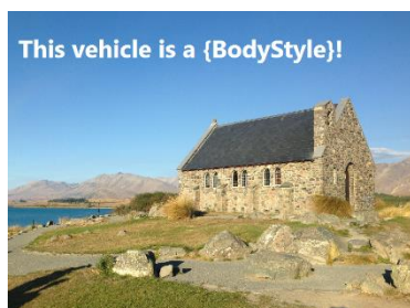
Text inserted with {BodyStyle} placeholder